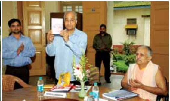
Justice Shrikrishna releasing the DVD on Yoga Practices