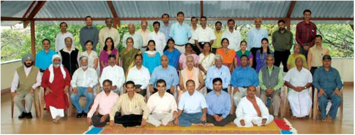
Members of Board of Advisors with Staff