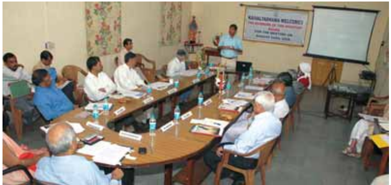
The Meeting in progress