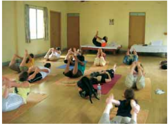
IDEX Group from Jaipur, performing the Asanas at the institute